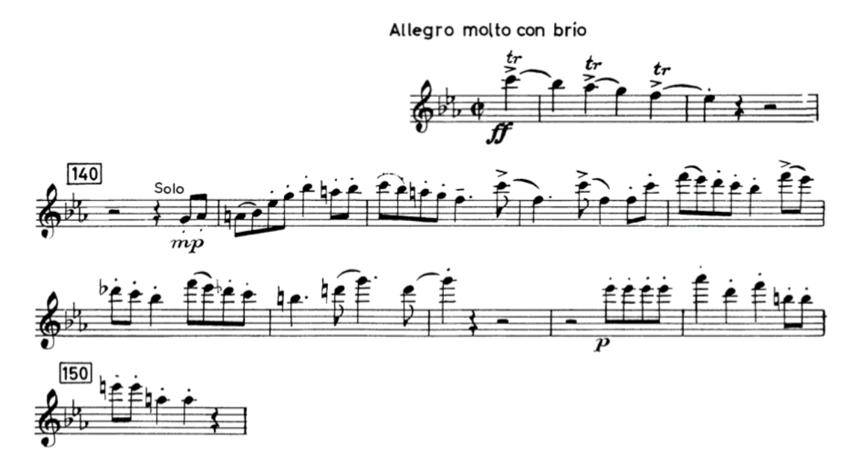
Holst: Second Suite in F