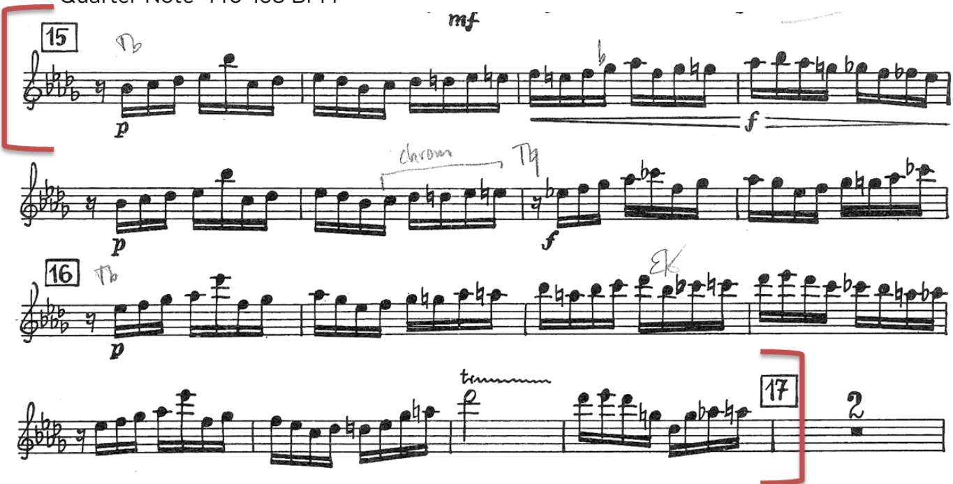
Marquez—Danzon No. 2 mm. 318 – Downbeat of mm. 329 PICCOLO

Stravinsky—Firebird Suite Infernal Dance: [15] - [17] Quarter Note=140-168 BPM